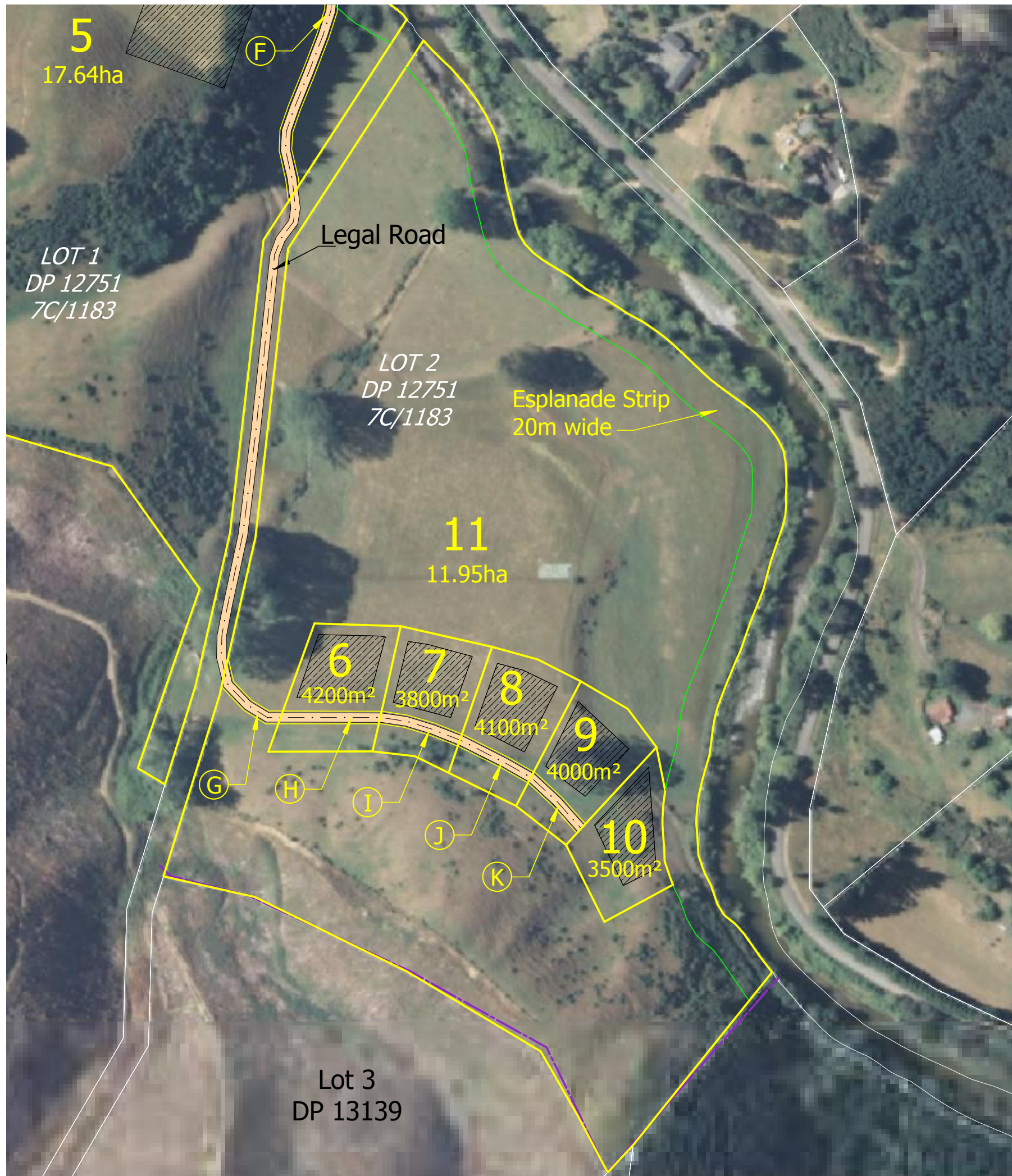
Lots 1-13 being proposed Subdivision of Lots 1 and 2 DP 12751 CT 7C/1183