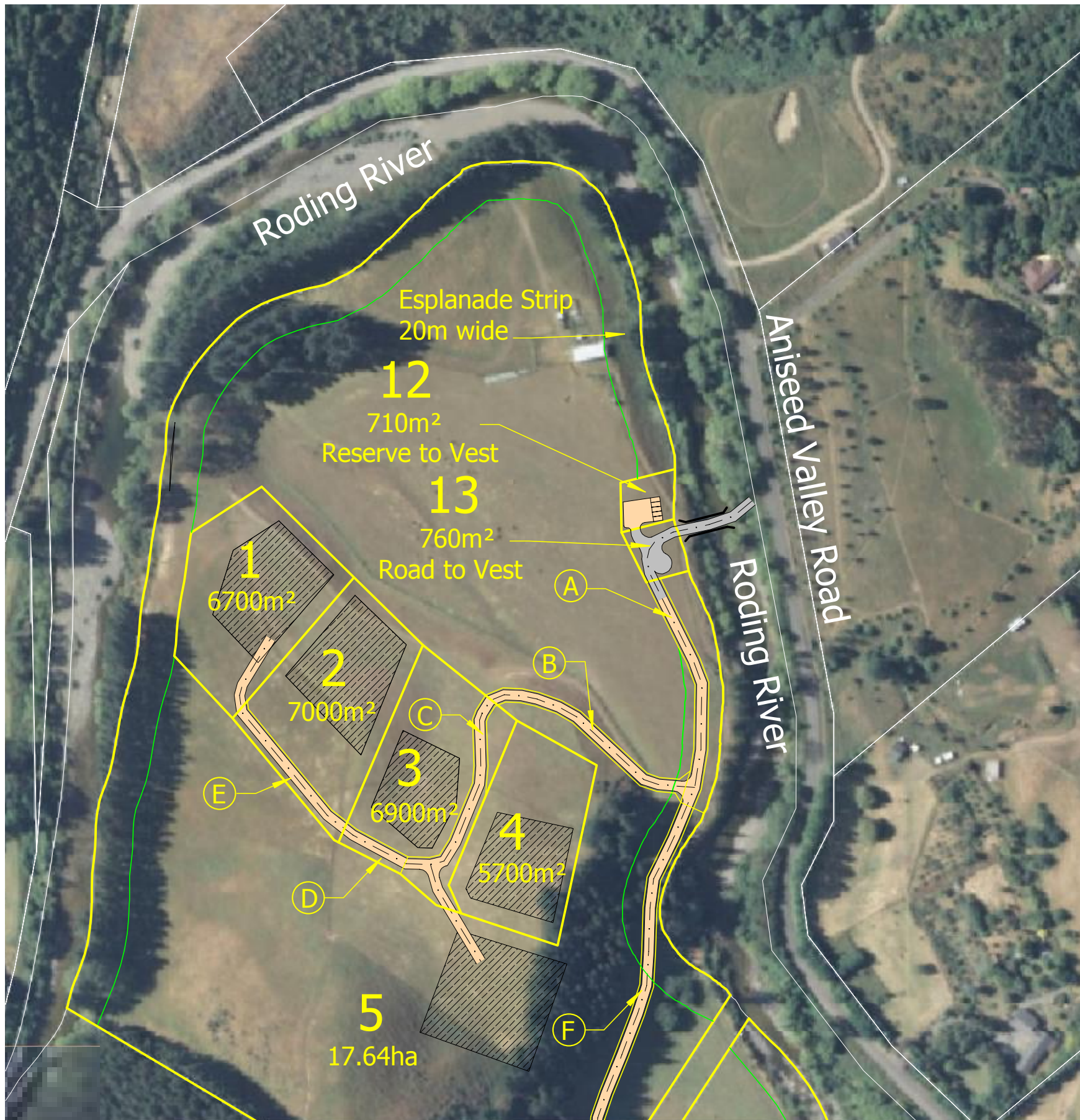
Lots 1-13 being proposed Subdivision of Lots 1 and 2 DP 12751 CT 7C/1183